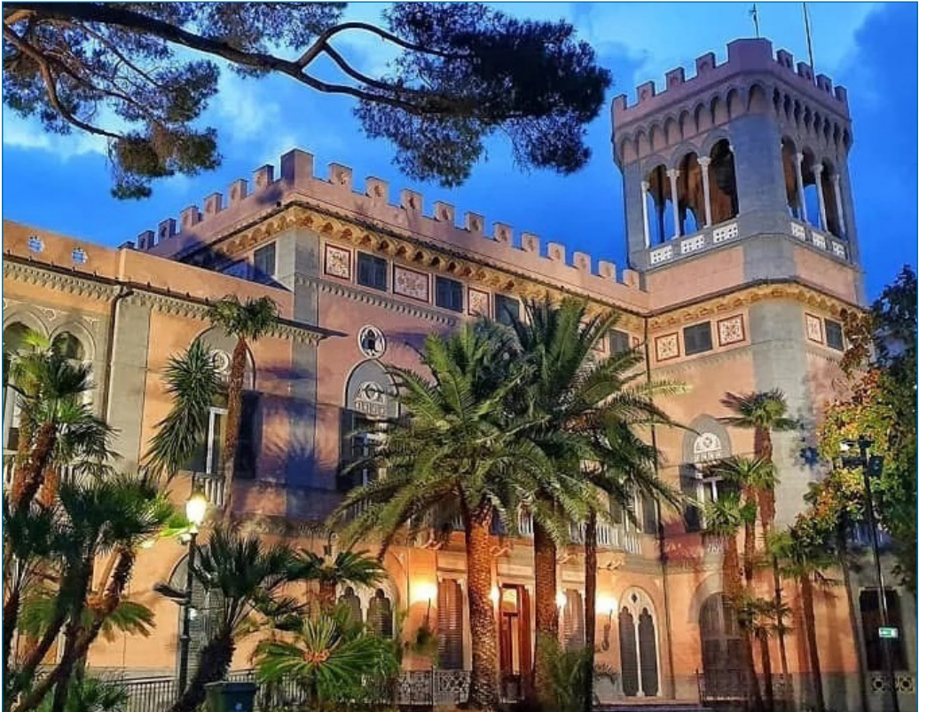
I.M.S.S.E.A. training seat in Arenzano - Genoa (Italy)